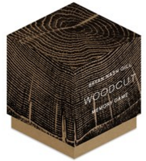
Woodcut Memory Game