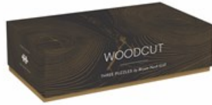
Woodcut: Three Puzzles